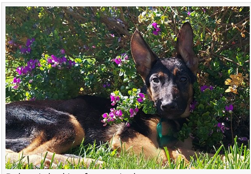
Dalton is looking for a quiet home.

HUNTINGTON BEACH, CALIFORNIA, UNITED STATES, June 17, 2024 /EINPresswire.com/ -- IT'S A PAW-TRIOTIC PAW-TY FEATURING PUPPIES FOR ADOPTION! JOIN GERMAN SHEPHERD RESCUE OF OC FOR "PUPPIES ON PARADE!" A Free Family-Friendly Community Event