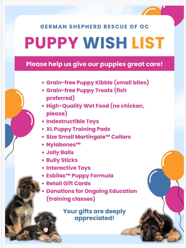
Puppies need supporters!

deductible as allowed by law. For more information, visit gsroc.org or follow German Shepherd Rescue of OC on Facebook.