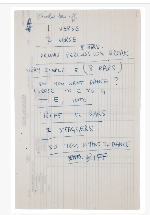
Written by Paul McCartney the handwritten lyrics to "Birthday" on Sept 18, 1968

Ringo Starr Signed CBS Records Employee Jacket - A beige lab coat-style jacket signed by Ringo Starr, with a CBS patch, size 38, and a document of authenticity. Estimated $1,500-2,000.