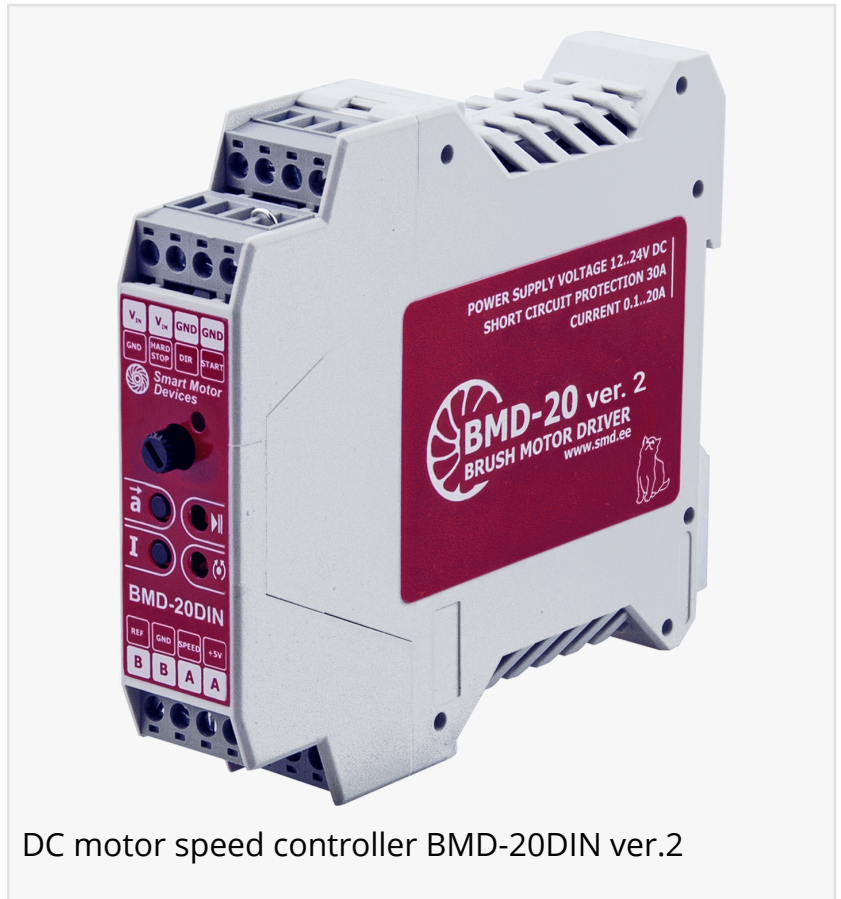
DC motor speed controller BMD-20DIN ver.2

TALLINN, ESTONIA, June 17, 2024 /EINPresswire.com/ -- Most controllers at the industrial market offer one input signal option for DC motor speed control . Most often, this is an analog voltage signal with a fixed range. Such devices fit well into existing systems only if the control device has the ability to generate the appropriate signal. The new controller BMD-20DIN ver.2 from Smart Motor Devices developers offers 6 different signal options for motor speed regulation, so its compatibility and ability to use with various devices is significantly wider.