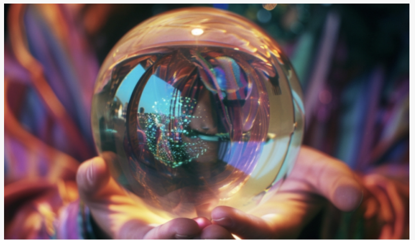
Lounge Lizard Works with Clients To Future Proof Their Business Endeavors

State-of-the-Art Web Design: Their web design services focus on creating visually stunning, user-friendly websites that provide an exceptional user experience. They leverage the latest technologies and design principles to ensure clients' websites stand out and effectively represent their brand.