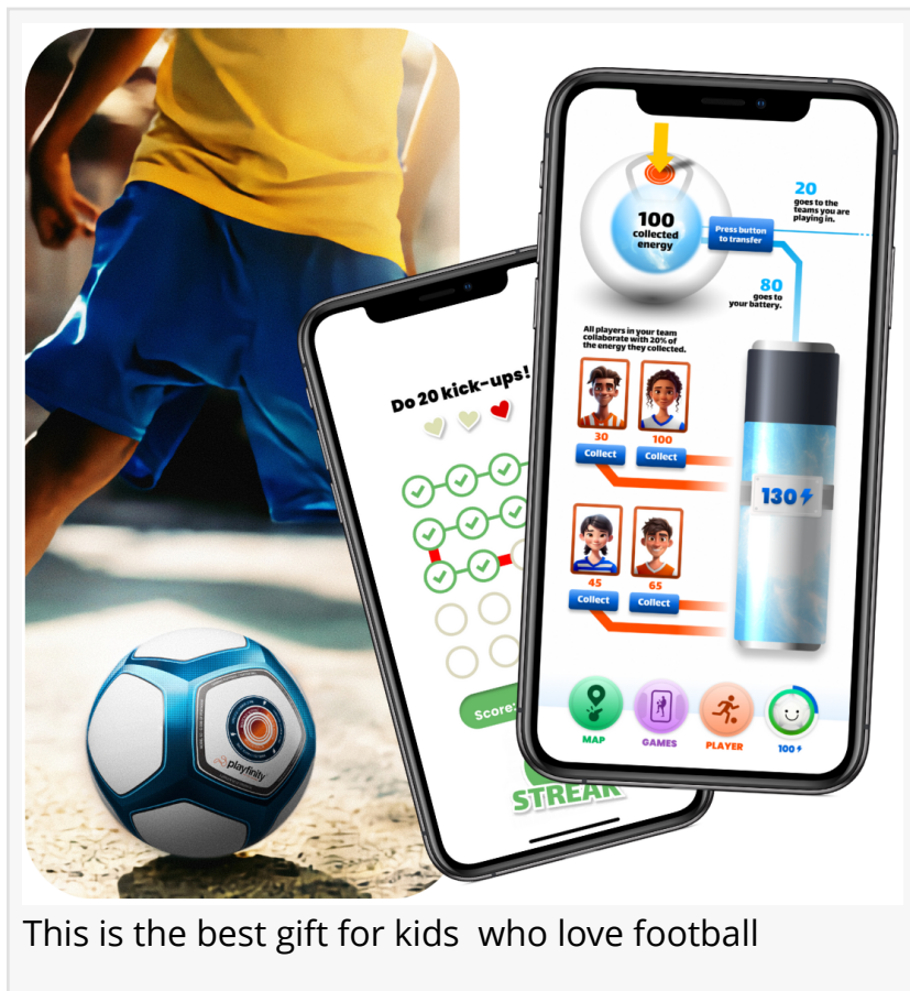
This is the best gift for kids who love football

Anton Sport, renowned for its dedication to high-quality sports gear and customer satisfaction, is the perfect partner for this launch. With a strong presence across Norway, Anton Sport will provide an ideal opportunity for introducing the innovative Gaming Football to a wide audience.