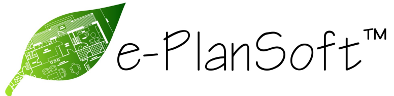
e-PlanSoft company logo

The e-PlanSoft™ solution for the Village of Tequesta includes several key features to address these challenges. Five fully named licenses have been provided, with four allocated to the building department and one to the fire department. Integration with BS&A was identified as essential for ensuring a seamless workflow and effective data management. The solution also offers digital project management capabilities, enabling efficient tracking of plan reviews,