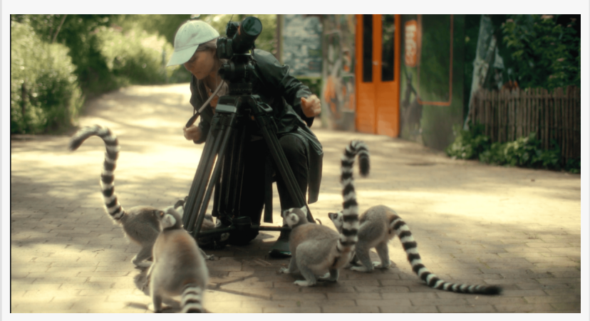
"Second Nature," a documentary feature film by Drew Denny, will screen during Queer Rhapsody, a groundbreaking, community-driven LGBTQIA+ film series at five iconic L.A. venues between July 19 and 28.

creating spaces of belonging, and propelling LGBTQIA+ affirmation beyond representation to empowered narrative leadership."