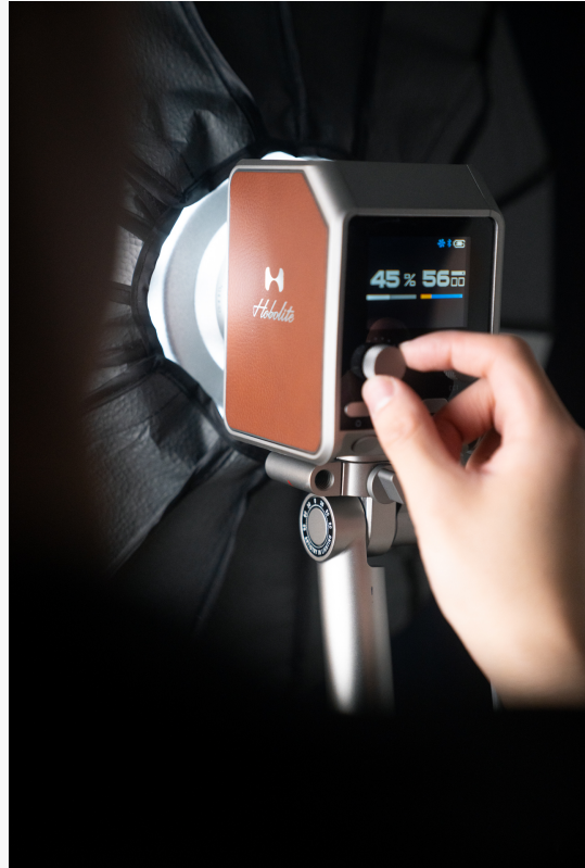
Hobolite Avant 100W