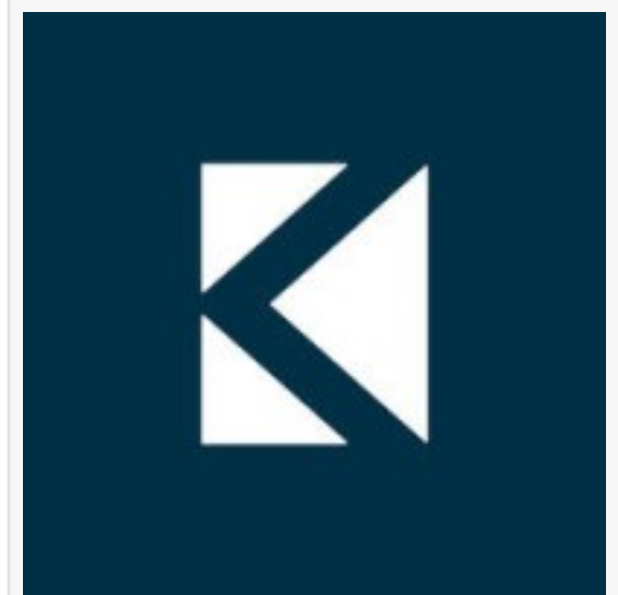
Private Real Estate Investment Group Based in Los Angeles

For many graduates, graduation means finding their first apartment, a significant step towards independence. K3/Alpine Property Management is here to help with valuable advice to make this process both thrilling and manageable.