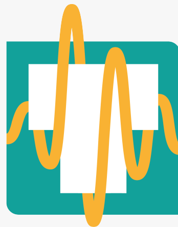
Building a Safer Social Media Platform