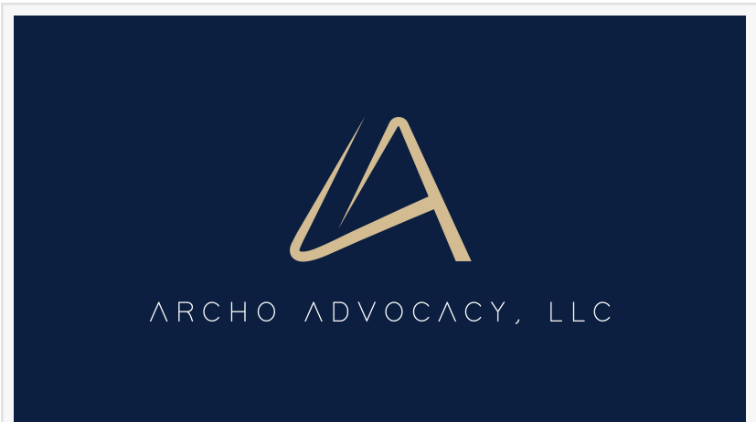
Archo Advocacy, LLC

-- Archo Advocacy, LLC, a leader in healthcare research and analysis, is proud to announce the release of its much-anticipated " ELAVAY: PATIENT INSIGHTS. ELEVATED HEALTHCARE. " 2024 Oncology Research Report. The report offers a thorough review of the current trends, innovations, and major contributors in the field of oncology. It focuses on the significant advances shaping the future of cancer treatment, considering the perspective of patients and their care needs, as well as strategies to engage the patient community effectively. Feedback was gathered from patient advocates, professional societies, and community-based organizations to evaluate the performance of the organizations involved in oncology care.