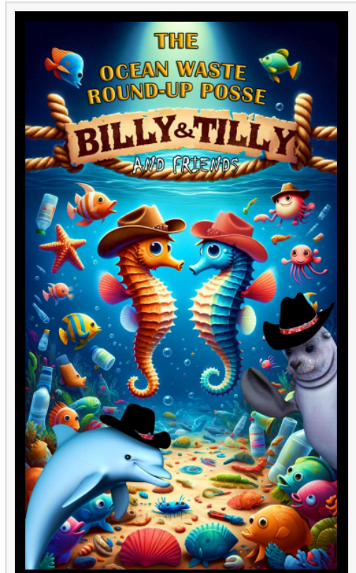
Billy & Tilly and Friends

A hallmark of the film is its strong emphasis on community and environmental action. The story showcases how individual actions and collective efforts can make a significant impact on the environment. This theme is particularly relevant in today's world, where ocean pollution poses a