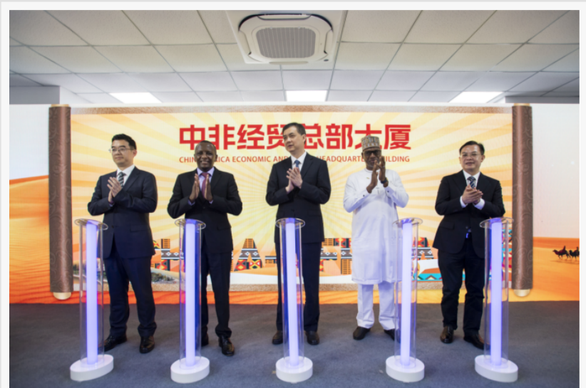
The China-Africa Trade Headquarters Building was officially inaugurated.