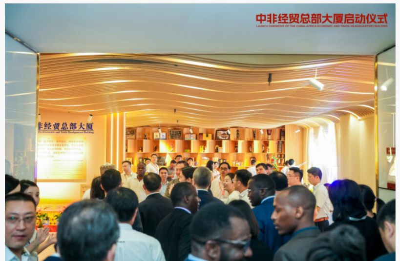
The China-Africa Trade Headquarters Building attracts numerous visitors