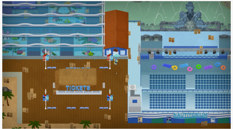
Super Fish parachutes into Super Sea Land

Cut tall grass and loot abandoned structures in search of the guns, Super Powerups and health juice you'll need to survive, and watch out for the poisonous Skunk Gas, slowly seeping in from the edges of the map. Super Animal Royale features carefully balanced run-and-gun gameplay combined with an intuitive fog of war system that restricts a player's view to line of sight, allowing for sneaky, strategic play. Whether predator or prey, only one can reach the top of the food chain.