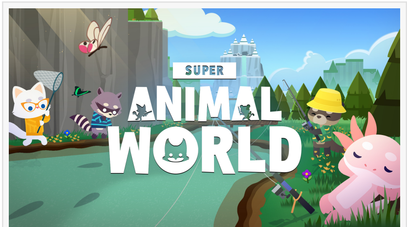
Super Animal World expansion coming free this summer

/EINPresswire.com/ -- Super Animal Royale fans have been waiting patiently to find out what's next, and today Pixile revealed the game's biggest addition since its initial development. The Super Animal World expansion invites players to relax together in a new social hub, where they can fish, catch bugs, compete in hamster ball races, and more. Watch the reveal trailer: https://youtu.be/ykNOCEA1p2o