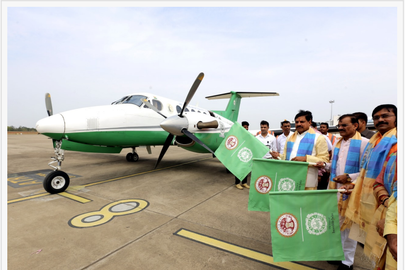
Inaugural of the Intra-State Air Service name "PM Shri Paryatan Vayu Seva" in Madhya Pradesh