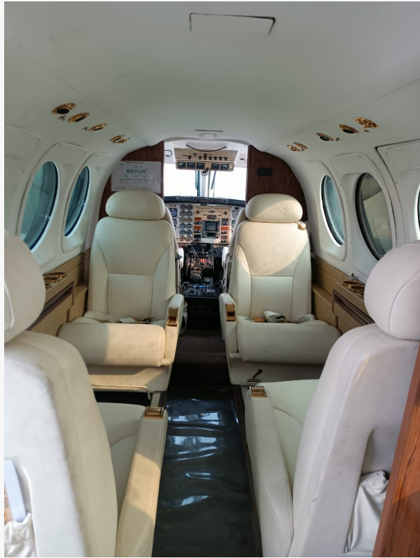
The Interiors of the FlyOla aircraft

Clean and green Madhya Pradesh is one of the most popular travel destinations in India and created a record of footfalls in 2023 with an increase in tourism footfalls of 3 times compared to 2022. Madhya Pradesh as a State is also reputed as a safe destination for travel, especially for solo women travelers. Deep spiritual and religious tourism authentic experiences in Madhya Pradesh is an emerging highlight trend.