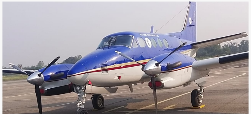
6 seater FlyOla Aircraft for intra-state air service