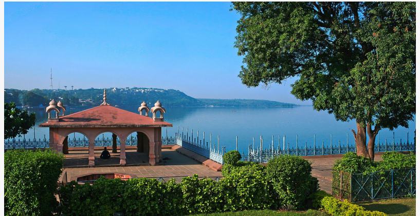
Upper Lake Bhojtal in Bhopal - one of the cities that will operate the intra-state aircraft