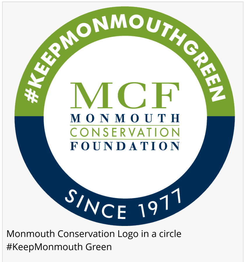
Monmouth Conservation Logo in a circle #KeepMonmouth Green