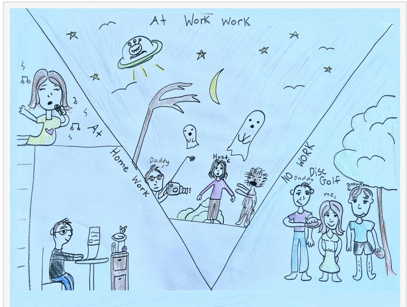
Recruiting for Good celebrates 4th grade girl whose drawing landed her The Sweetest Gig; 'Discover Me for Good!' in June 2024

In 2021, Recruiting for Good created sweet girl gig; ' Discover Me for Good .' Girls create a collage of all the things 'they love;' and earn a sweet gift card.