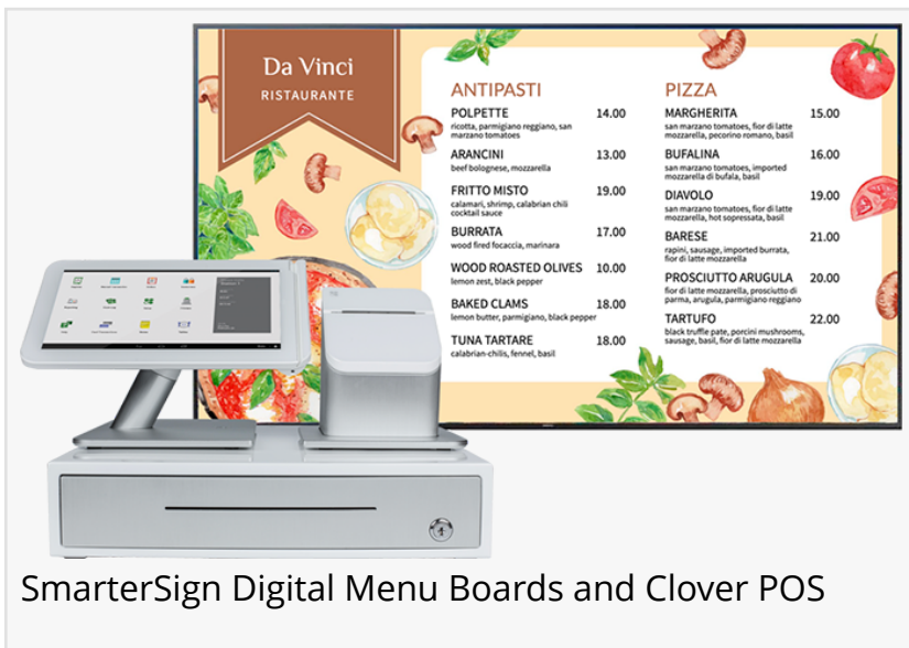
SmarterSign Digital Menu Boards and Clover POS

SmarterSign, a leader in digital menu board solutions with 18 years of expertise, proudly announces its latest integration with Clover POS . This innovative integration offers restaurant operators exceptional inventory control and real-time menu updates, transforming how digital menus are managed.