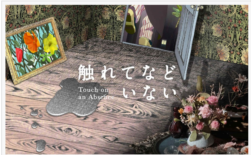
Warehouse TERRADA “Touch on an Absence”

We will host TENNOZ ART WEEK 2024, an art event aimed at bridging Japan and the international art scene and promoting international cultural tourism by programming world-class art content in the Art District Tennoz, Tokyo, and creating a platform for domestic and international art professionals and enthusiasts to gather. In its inaugural edition last year, the event attracted approximately 14,000 visitors, primarily art collectors from Japan and overseas, transforming Tennoz into a vibrant, cosmopolitan art district. In its second edition this year, TENNOZ ART WEEK 2024 will feature a new visual installation by Tabaimo and three animation directors, sake tasting at gallery complex facilities, an art and