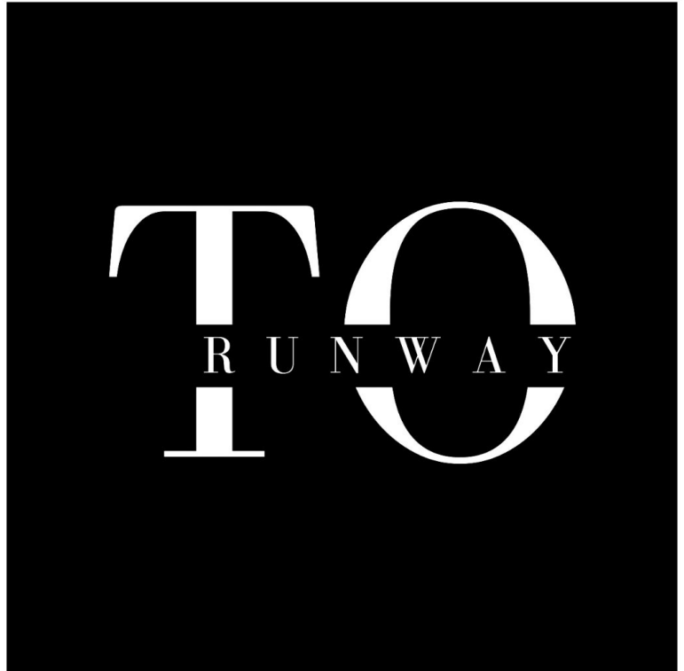
Toronto Fashion Show