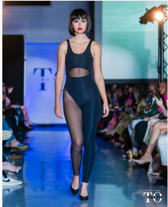
Runwayto 2023 Model Image