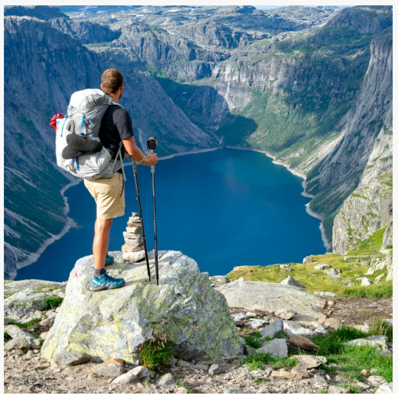
A hiker equipped with HikeGuard+ attached to his trekking poles, ready for an adventurous journey.