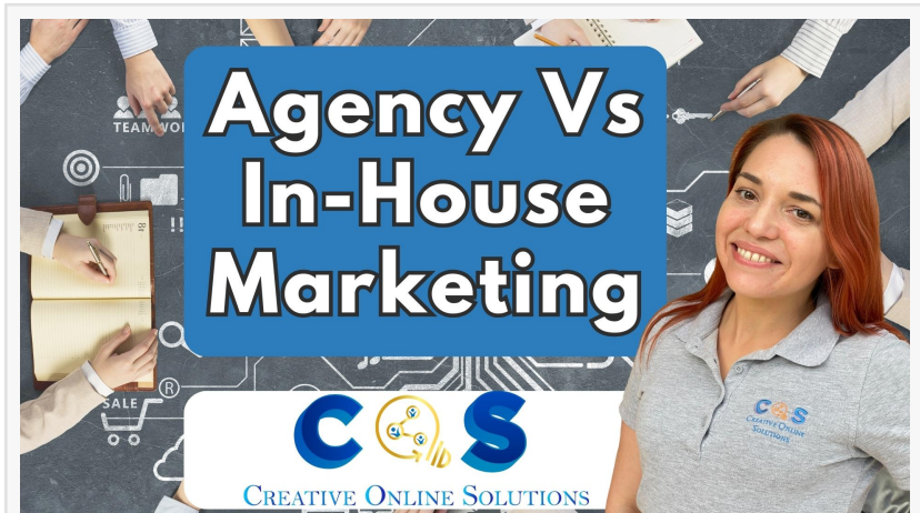
Agency vs In-House Marketing Agencies Analysis

The study is by COSMarketing Agency. It explores the hidden costs of in-house staffing. These costs include taxes, healthcare, training, and the tech for modern marketing efforts. An individual employee's tech setup costs a lot. It includes laptops, software, maintenance, and