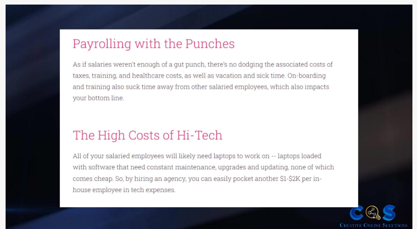
Benefits of Outside Agency vs In-House Marketing