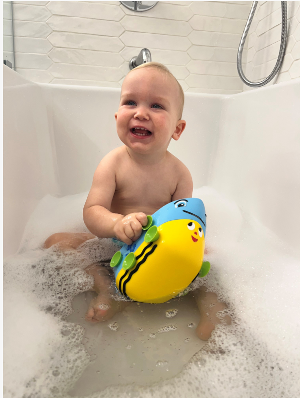
Baby playing with BobBee