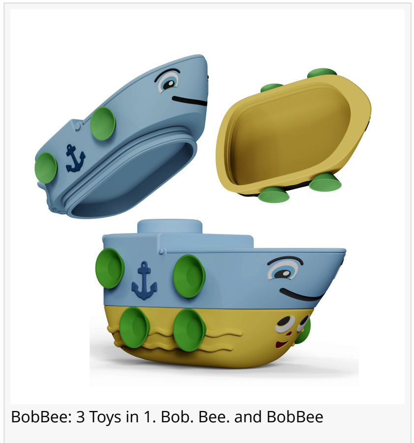
BobBee: 3 Toys in 1. Bob. Bee. and BobBee