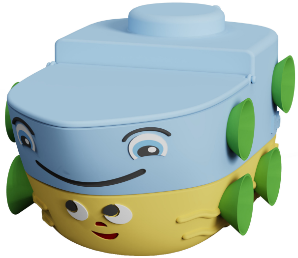
BobBee Water Toy

About Griddly: We are the creators, manufacturers and marketers of original toys, games and activity kits that are designed for the entire "grid" of people. Our mission is to inspire creativity, imagination, out-of-the-box learning, healthy living and lively interaction through the fun of toys, games and activities. Our multi-award-winning line of STEAM (Science. Technology. Engineering.