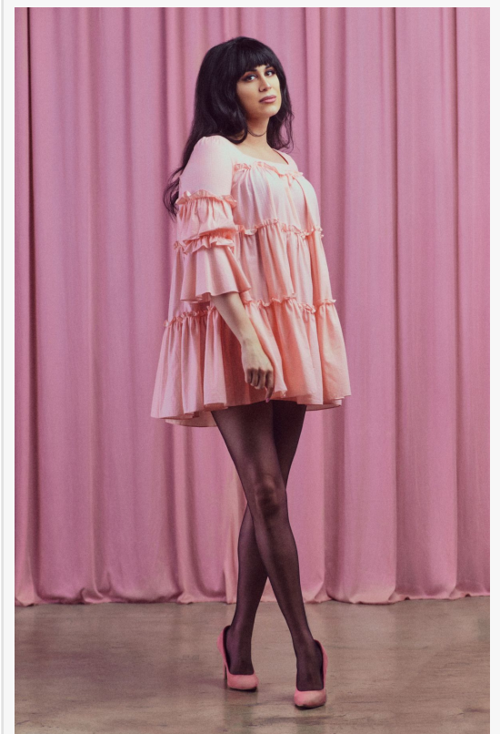
The splash mini dress introduced in the new collection, modern luxury with timeless charm wore by Roz Hernandez actress from "Living from the Dead".

Urban Explorer Jumpsuit is a modern reinterpretation of the classic jumpsuit is perfect for the trendsetter. Made from durable denim with a hint of stretch, it features a relaxed fit, adjustable