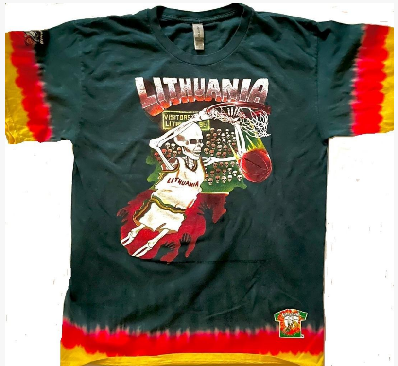
Just released for 2024, the Classic Slam-Dunking Skeleton on Green T-Shirt with a touch of tie-dye.