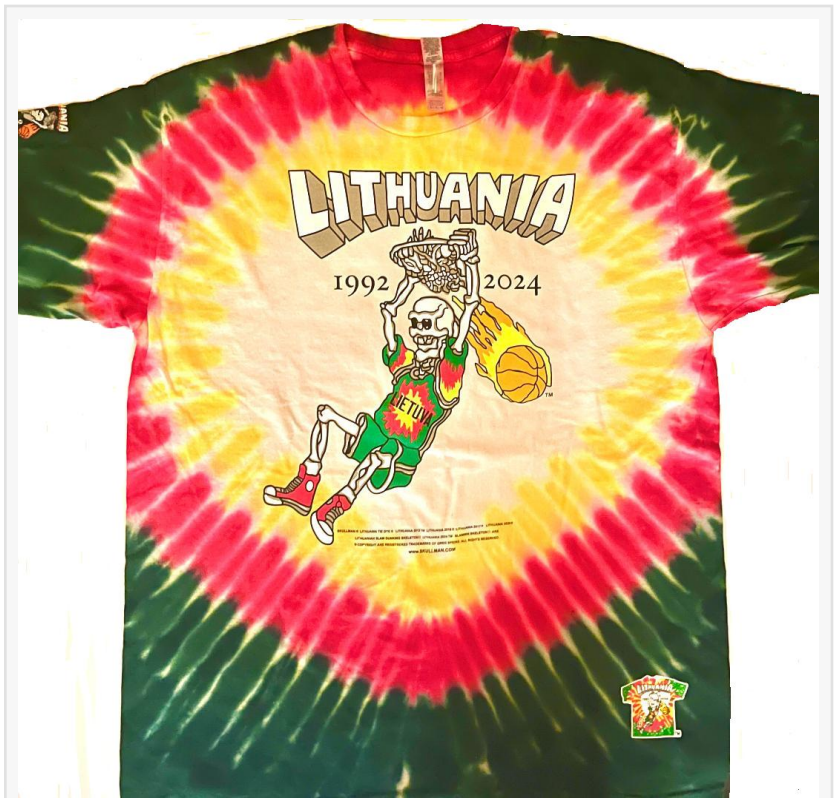
2024 Edition 1993 Slammin Skullman® from the Skullman Basketball Hall of Fame Enshrinement new 2024 Collector's Edition on the Classic Lithuania Tie Dye® T-Shirt

"The 1992 Lithuanian Basketball Team represents what happens in freedom...people excel. The Lithuanian Slam-Dunking Skullman® represents rising from nothing. Like a Phoenix from the ashes to slam-dunking a flaming basketball. It's not a dead skeleton, but the Skullman is alive and represents rebirth and a new life. When you are free you have the opportunity to succeed as an individual while still being part of a team. It was not only a victory in Olympic sports, but it was as if it were an overall triumph over communism itself," recalled Speirs.