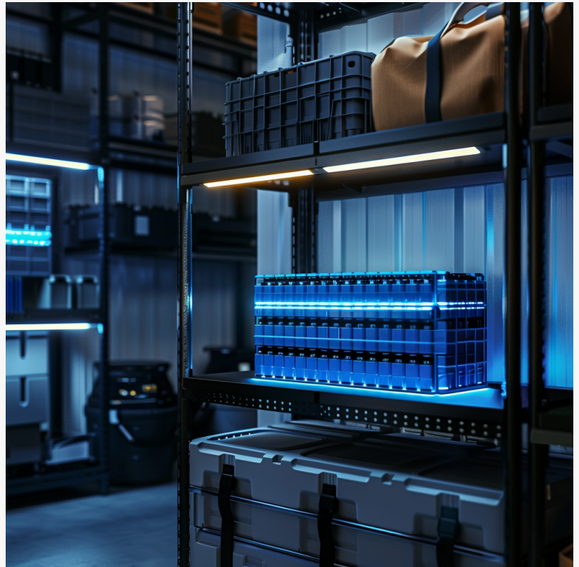
All Things Off Grid - DIY ESS Battery Pack for Off Grid Energy Storage

At the heart of the ATOG DIY ESS Battery Kit is the highest grade lithium iron phosphate (LFP)