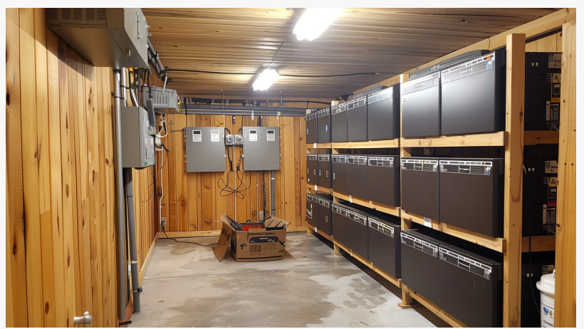
All Things Off Grid - DIY Lithium Battery Pack for Off Grid Energy Storage

Safety remains a top priority for All Things Off Grid, and the ATOG DIY ESS Battery Kit incorporates quality cell balancing systems to ensure optimal performance and protection. These systems eschew the use of poor quality BMS units with consumer grade PCBs that fail repeatedly over time, safeguarding against potential hazards and extending the overall lifespan