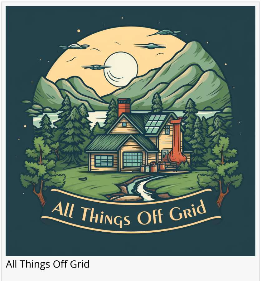
All Things Off Grid

All Things Off Grid is committed to guiding customers through the process of implementing these advanced battery systems, with comprehensive installation support to assist with complex projects. The company's website features a range of resources, including instructional videos, equipment specifications, and resources for a smooth and successful installation process of its off grid energy storage systems.