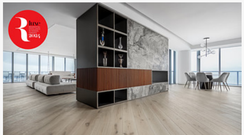
Giginella 220 by European Flooring of Fort Lauderdale