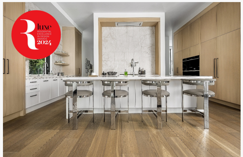
Giuseppina 220 G1 by European Flooring of Palm Beach