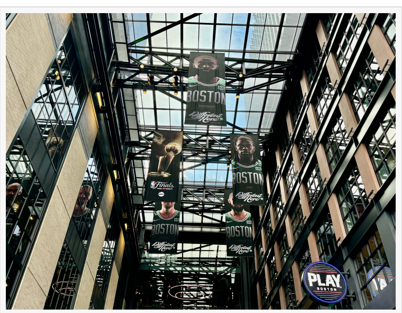
Celtic Banners at the TD. Garden during the 2024 NBA Finals.

As neighbors, we follow the example of the Boston Celtics using teamwork and excellence to help Americans with disabilities meet the challenges they face every day to find jobs. We can't wait to see the Duck Boats and to fly another championship banner in the neighborhood.