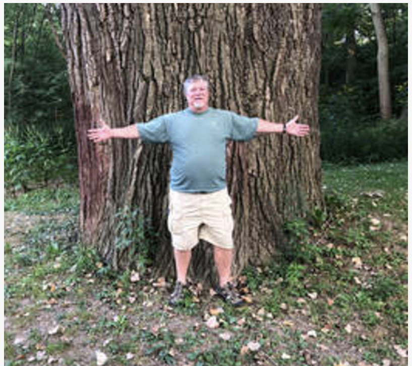
Where is the biggest tree in Michigan?

/EINPresswire.com/ -- ReLeaf Michigan , a tree-planting and education nonprofit organization serving communities throughout the state of Michigan, today announced that Meijer is a Platinum Sponsor of the 16th biennial Michigan Big Tree Hunt . The contest, which offers prizes for identifying the biggest trees in Michigan, is open to participants of all ages. The current Michigan Big Tree Hunt has already received over 201 entries from 61 of the 83 counties across the state.