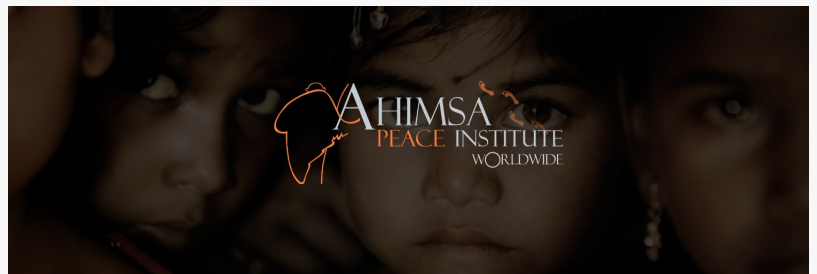
The Children of AVANI

The new NIC headquarters, a seven-story facility in the Mangabeiras neighborhood, is equipped with a professional audiovisual system for high-quality film screenings, ensuring an engaging