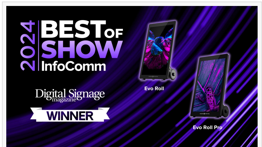
The Evo Roll series wins Best of Show award at InfoComm 2024