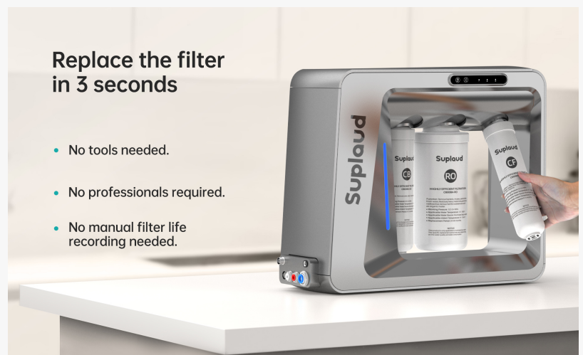
Suplaud c600ba RO home filtration system under sink