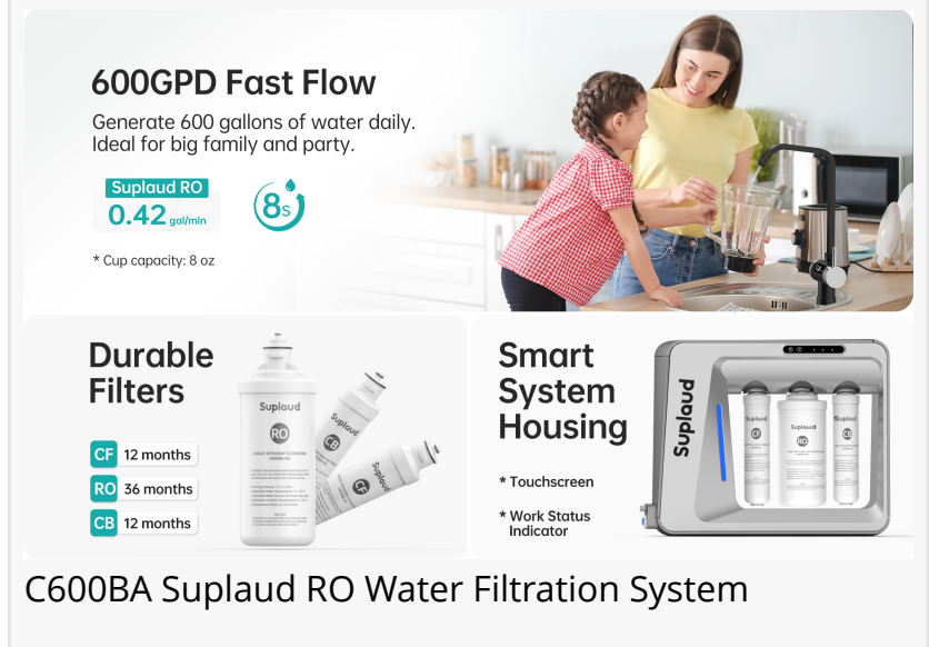
C600BA Suplaud RO Water Filtration System