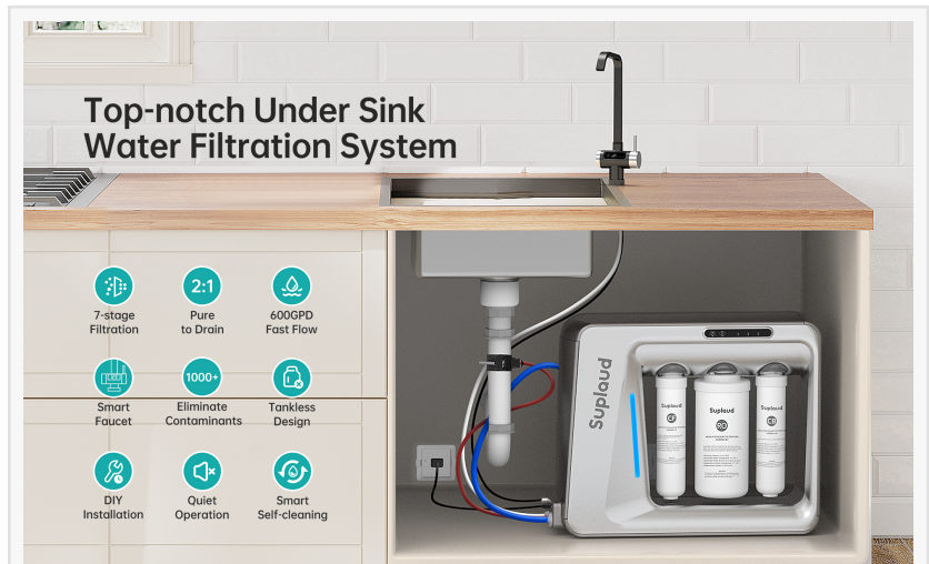
C600BA Suplaud Tankless Reverse Osmosis System