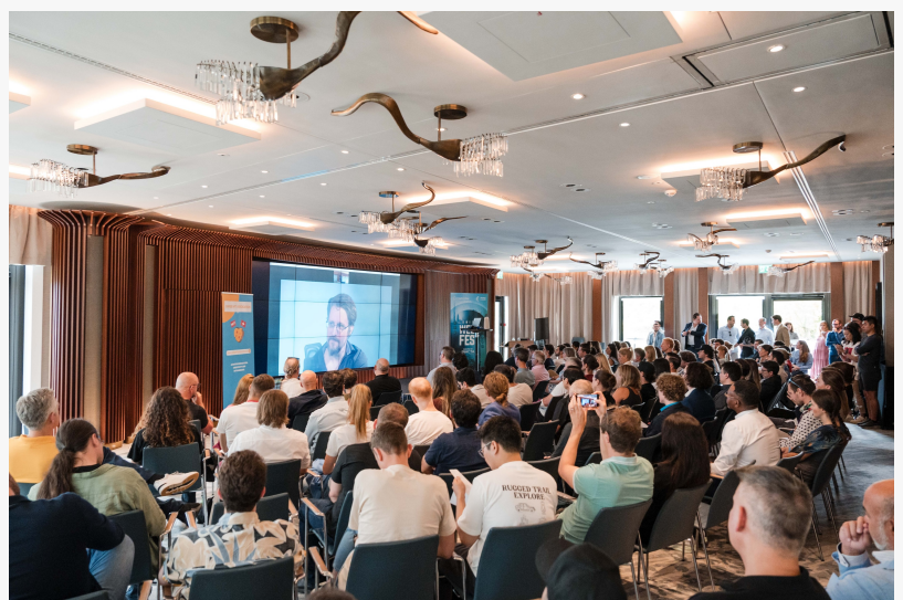
Unconference with Edward Snowden