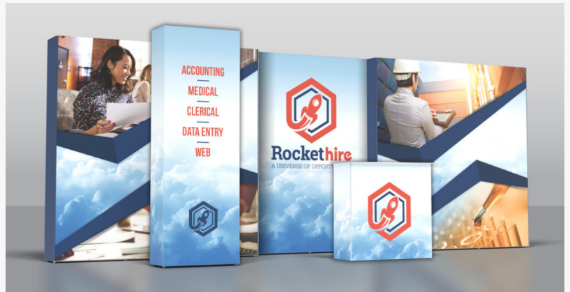
Trade Show Displays from Displayit