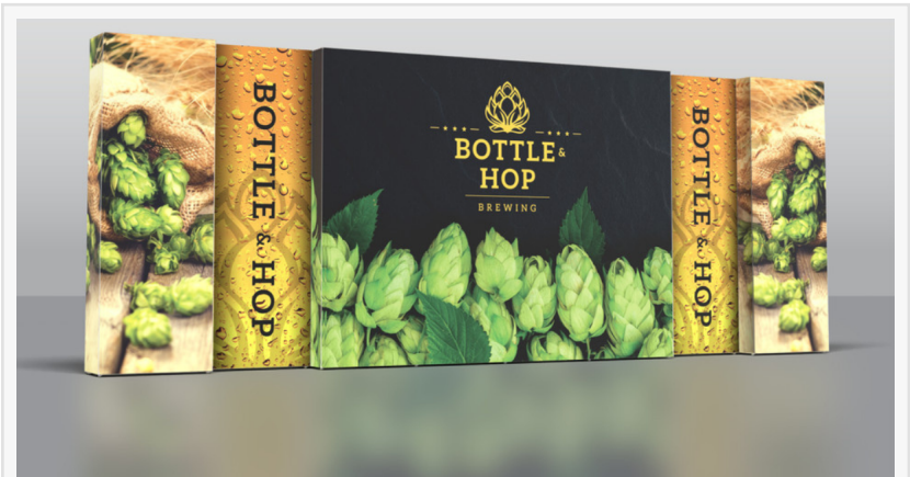
Trade Show Banners

Displayit's new backlit trade show displays are designed to provide a striking visual impact, ensuring that businesses stand out in crowded event spaces. The product line includes a variety of display options such as backlit backwalls, trade show banners , and trade show stands , as well as complete booth display kits. Each display is equipped with state-of-the-