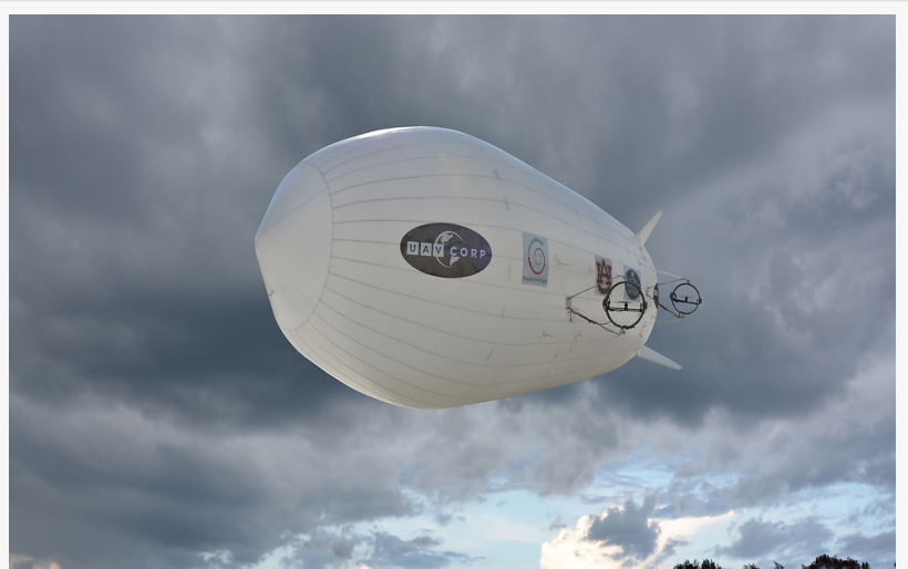
Platform in flight

UAV Corp is a premier developer of manned and unmanned aerial vehicle technology, with decades of experience specializing in highly maneuverable lighter-than-air technologies for commercial and government solutions. With a focus on innovation and reliability, UAV Corp provides cutting-edge platforms that enhance operational capabilities across various sectors.