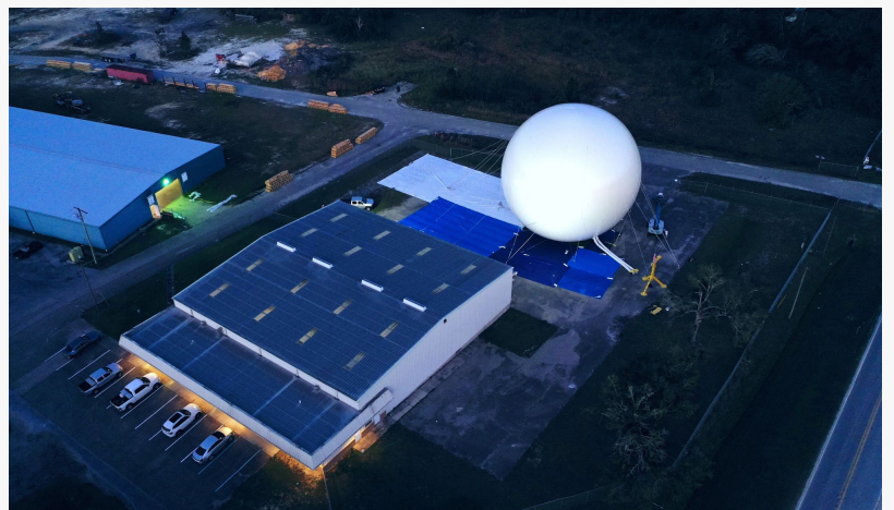
Dart "Moon" Vehicle