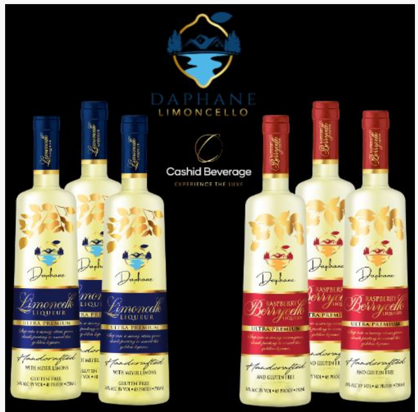
Cashid Beverage and Daphane Limoncello Bottles