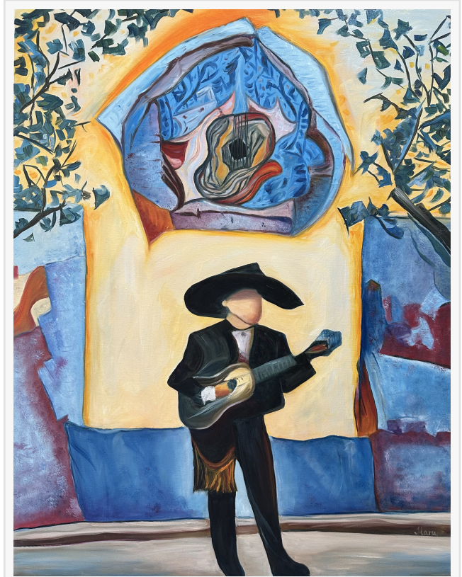
Oil on Cotton Canvas, 70x90 The first piece realized since the arrival in Mexico, is a transposition of the artist's view and experience during the first months spent traveling various states of the republic.

This press release can be viewed online at: https://www.einpresswire.com/article/722099268