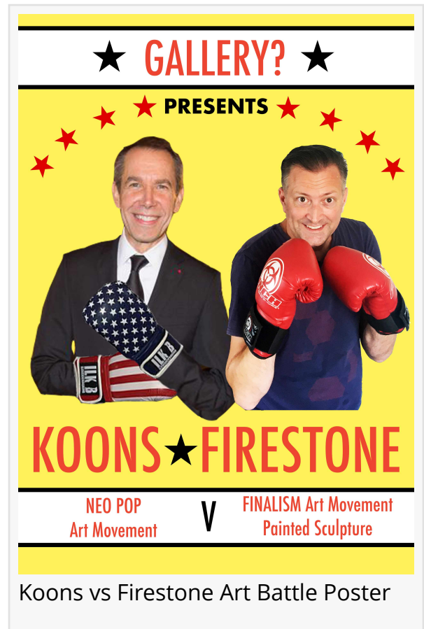
Koons vs Firestone Art Battle Poster

Finalism transitioned to Facebook for easier management and broader reach. Explore the movement on their Facebook Page . Firestone's artworks and artistic evolution can be seen on Saatchi Art Profile . To grasp the essence of painted sculpture, watch a Met Museum clip here .