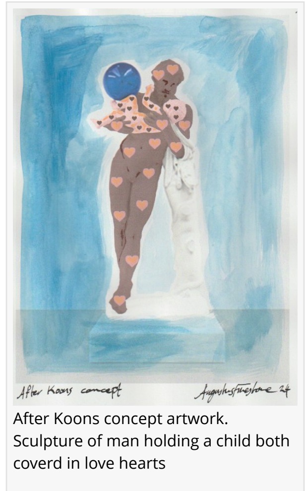
After Koons concept artwork. Sculpture of man holding a child both covered in love hearts