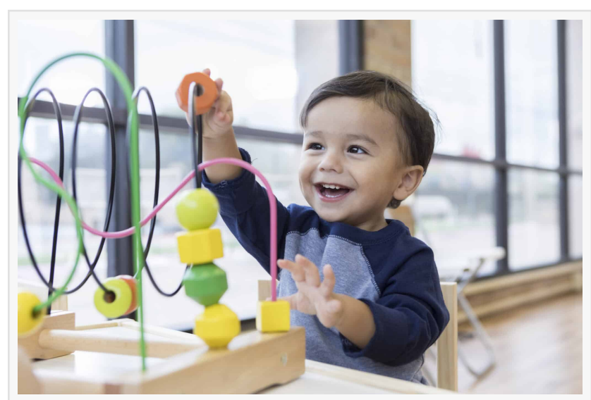
Children's Museum, Virginia

VIRGINIA, UNITED STATES, June 26, 2024 /EINPresswire.com/ -- Virginia is known for its rich history, stunning landscapes, and vibrant culture and it's also a fantastic destination for families. With a wide range of activities and attractions, Virginia offers endless opportunities for fun and learning for all ages. From children's museums to hiking trails, and zoos to festivals, it is easy to find something to suit every interest.