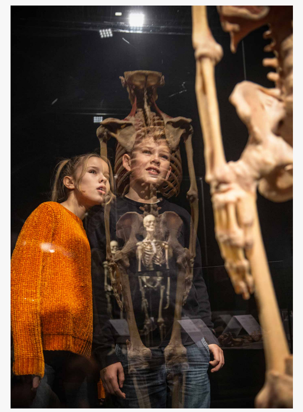
Science Museum of Virginia

This press release can be viewed online at: https://www.einpresswire.com/article/722304587