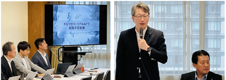
alt.ai, digital clones lead proposals to the Japanese government□Discussing the future of personal AI and the state of AI in Japan with the Liberal Democratic Party's digital society promotion headquarters