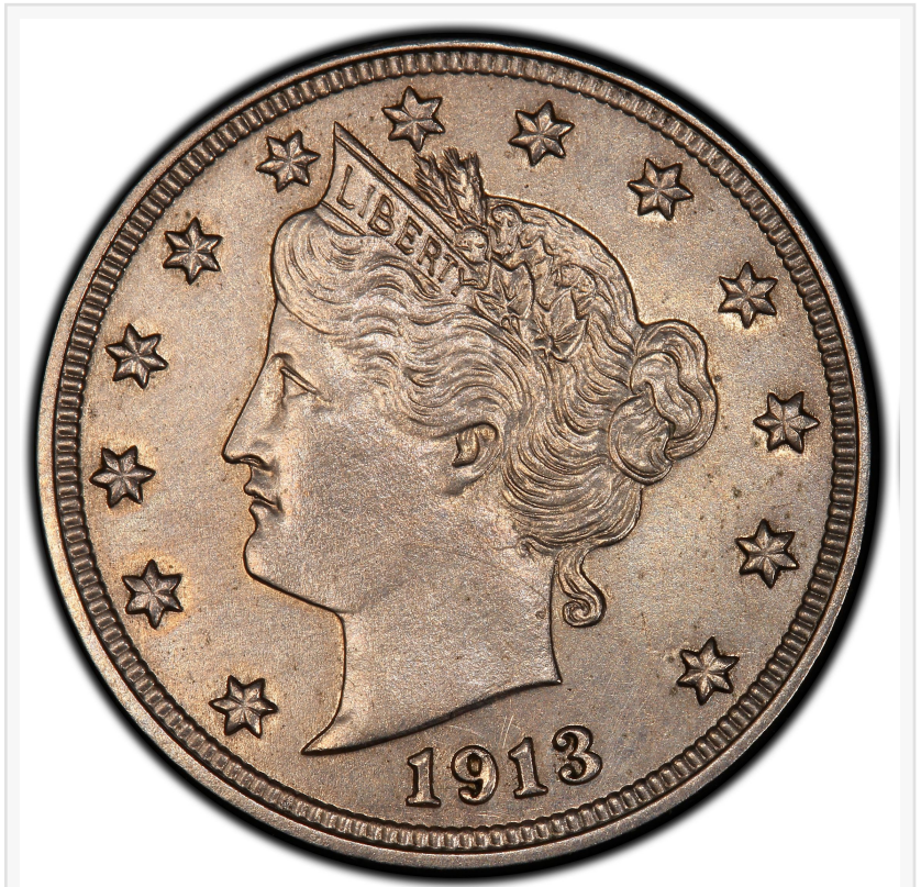
Insured for $6.25 million, the finest of the five known 1913 Liberty Head nickels will be displayed for the first time in Tampa at the Great American Coin and Collectibles Show, Sept. 11-14, 2024.

Open to the public, hundreds of dealers from across the country will be buying and selling rare coins, stamps, paper money, gold, and silver with the public. The United States Mint will be displaying and selling its available current product line and the Bill the Buffalo costumed mascot will hand out Youth Collector Kits and other educational materials for children.