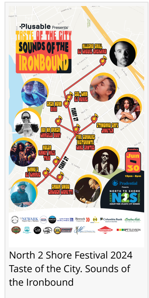
North 2 Shore Festival 2024 Taste of the City. Sounds of the Ironbound