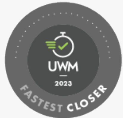
Fast Closer 2023