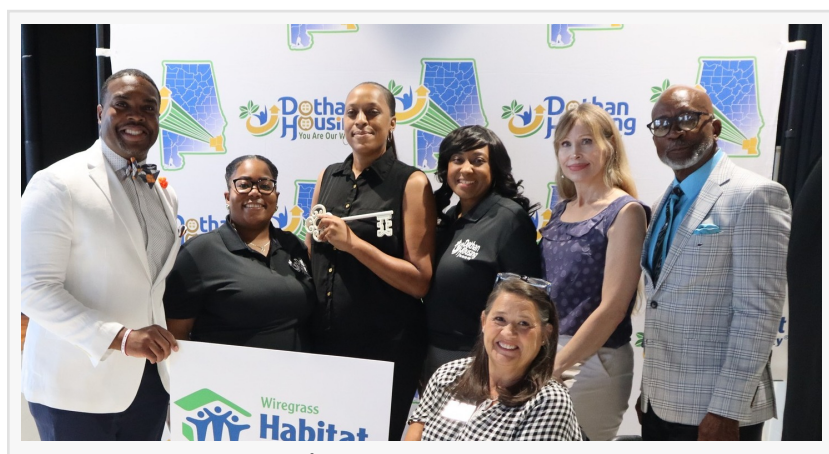
Wiregrass HFH_Dothan Housing_HCV Homeowners

DOTHAN, AL, UNITED STATES, July 2, 2024 /EINPresswire.com/ -- Dothan Housing joyously celebrated Homeownership Month in June through the public-private partnership with the Wiregrass Habitat for Humanity (HFH), a testament to the