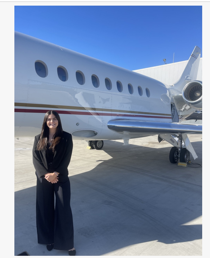
Amalfi Representative welcoming client onboard

This deal comes in the wake of Amalfi's overhaul of its Jet Card product as it aims to grow its client base and continue to offer its stand-out features against competitors.