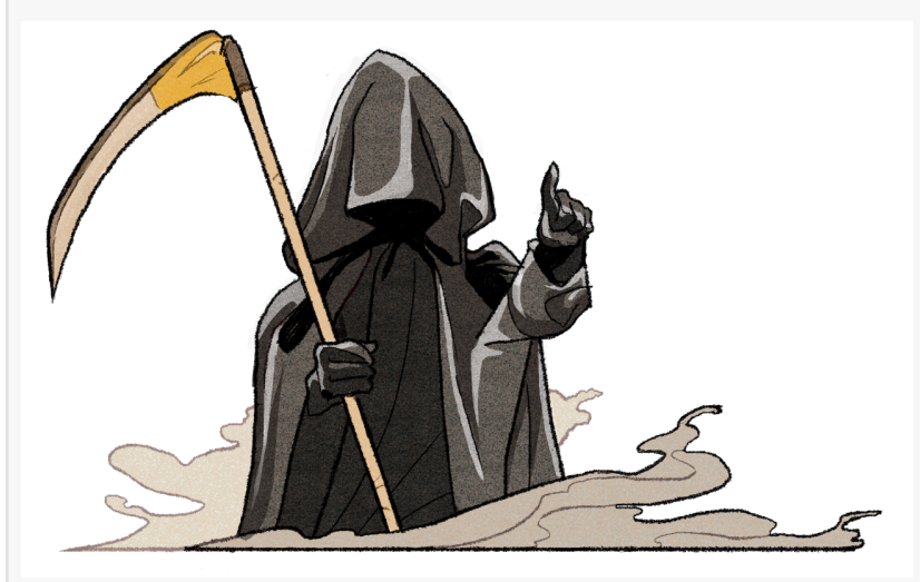
The Grim Reaper

This press release can be viewed online at: https://www.einpresswire.com/article/722527160