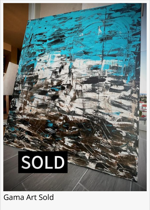
Gama Art Sold