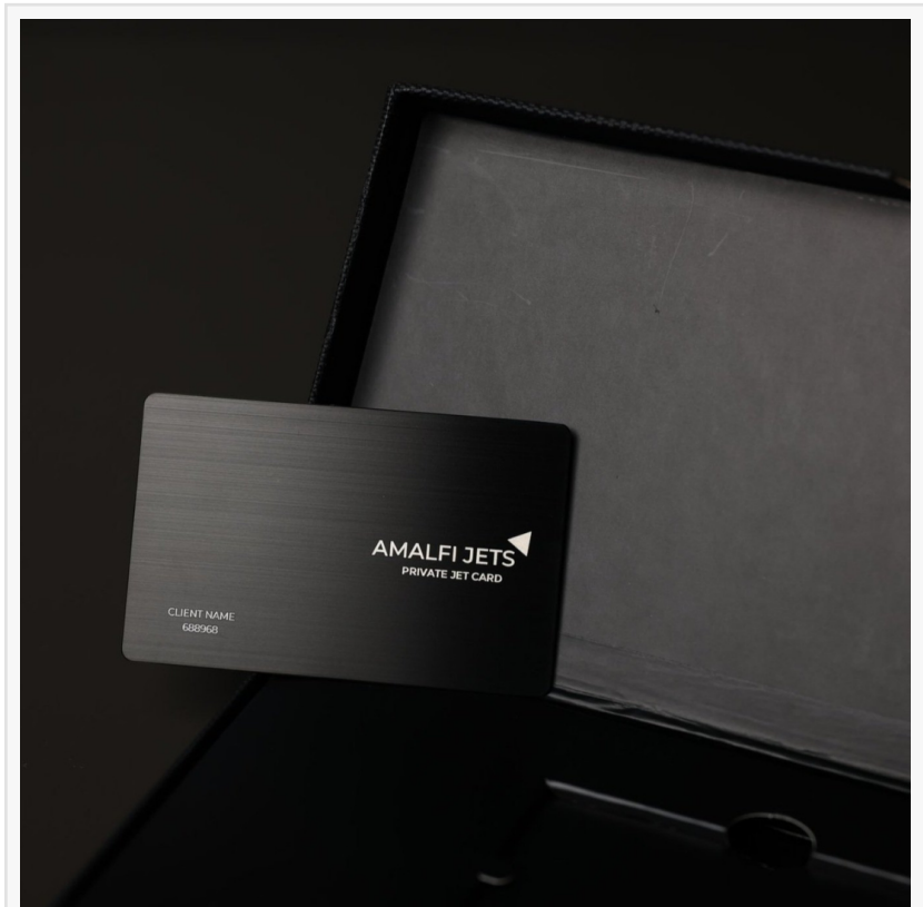
Amalfi One Jet Card

Cardholders who join the program in July will have no peak days in their contract for the next 12 calendar months after joining. In order to qualify for this promotion, interested Clients must purchase and fund their jet card from July 1 – 31 and deposit a minimum of $200,000 USD. This promotion is limited to 10 Cardholders total.