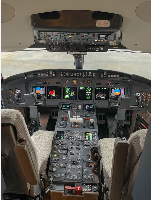
The cockpit onboard a recent Amalfi Flight to Las Vegas

Amalfi Jets is honored to provide exceptional customer service, with their in-house concierge team that is available 24/7 for their cardholders and the additional personnel on their team will strengthen this offering. The full Amalfi Experience includes complimentary Black Car Service, premium cuisine and alcohol, and an in-person representative at every departure airport. Amalfi