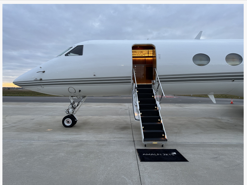
A Gulfstream GV getting ready for a recent Amalfi flight.