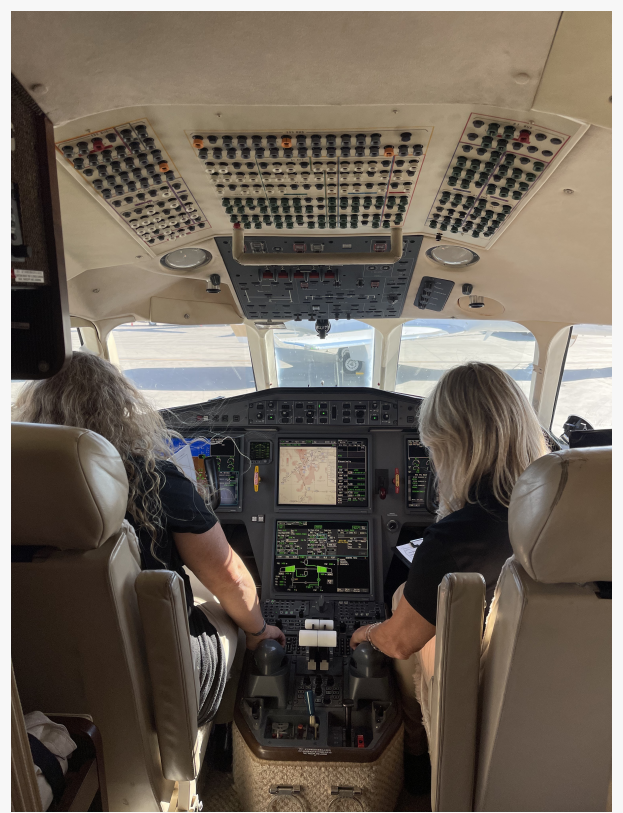
Amalfi's operator's pilots carrying out pre-flight checks

This press release can be viewed online at: https://www.einpresswire.com/article/722556077