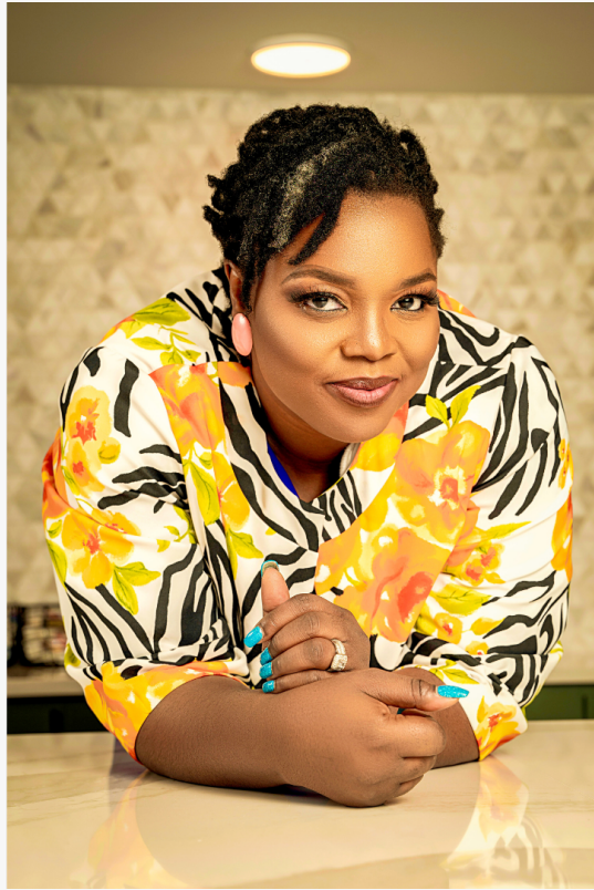
Family System Coach; CEO and Founder of You and Your Child (YYC) Foundation

This devotional is now available for purchase on Amazon, Barnes & Noble and other leading digital book stores worldwide. It is a must-have for parents, guardians, and educators looking to provide their children with a solid spiritual grounding.